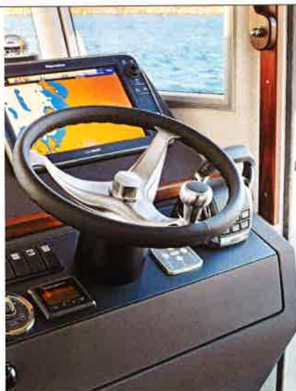
A tournament-style wheel with knob eases quick maneuvers at high speeds.

Beside the helm is a companion seat, accessed from the portside full-height pilothouse door, which can swivel back to face the U-shaped settee and